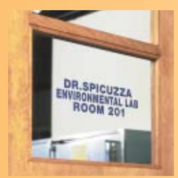
Cut Characters & Shapes